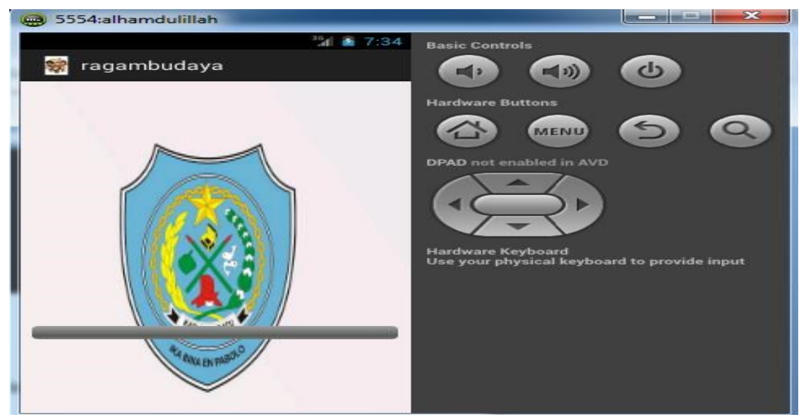
Figure 5. The Splashscreen Display of the Eclipse emulator Labuhanbatu Cultural Diversity Application

In Figure 4 is the display icon, in this display, the user can see the application icon from a variety of cultures in Labuhanbatu Regency before entering the application. Furthermore, in the Splashscreen display, the application of the cultural diversity of Labuhanbatu Regency community is contained in the Eclips emulator in Figure 4 and the display the search for diverse cultural communities in Labuhanbatu Regency. on the Eclipse emulator in Figure 5.