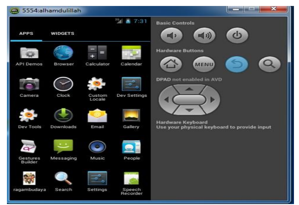
Figure 4. Appearance on the Icon Eclipse emulator of Labuhanbatu Regency Cultural Diversity Application.

The display Icon application of various cultures in Labuhanbatu Regency on Eclipse Emulator in Figure 4 presents an application that is in the android offline menu.