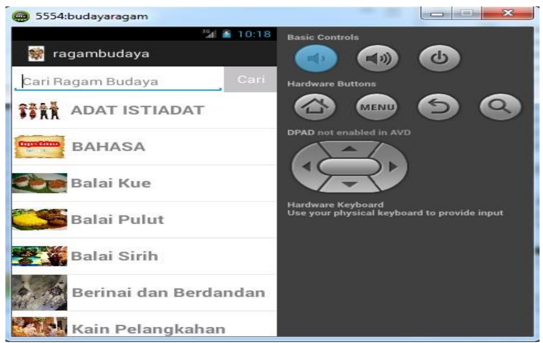
Figure 6. The Display of the Eclipse emulator of Labuhanbatu Regency Cultural Diversity Application

In Figure 6 the user can search for various languages contained in the application; for example, if you want to search an application for a variety of cultures, "Users can search for languages in a variety of cultural applications in Labuhanbatu Regency". Then, in the display of the application results of the various cultures in the Eclipse emulator set out in Figure 7.