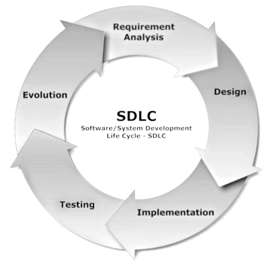
Figure 1. System Development Life Cycle (SDLC)

As for the system design method, the author uses the research method development method. The method used is the software development cycle model or the SDLC (Software Development Life Cycle) waterfall model [8]. Like Figure 1 below: