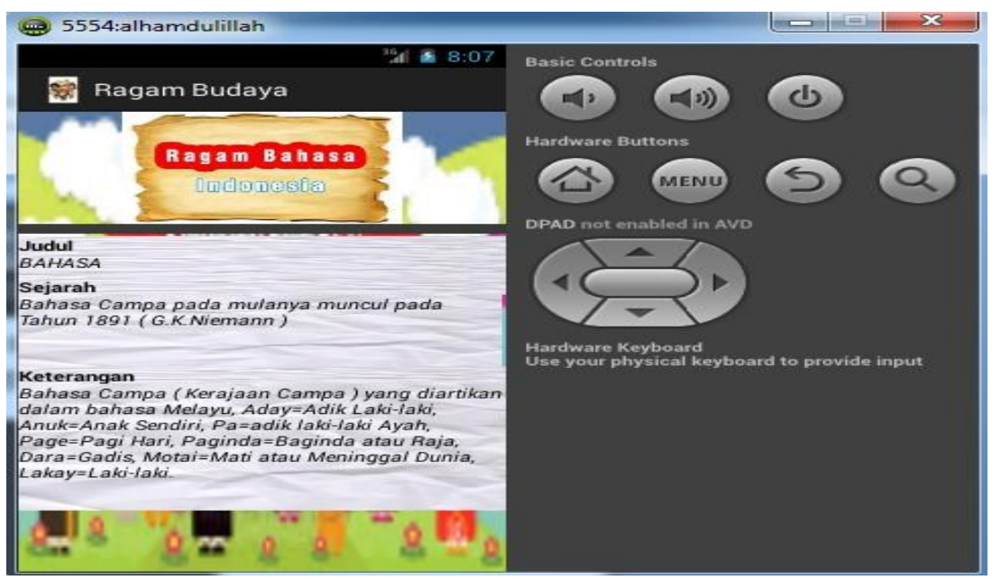
Figure 7. The Display Results Eclipse emulator of Labuhanbatu Regency Cultural Diversity Application

In the display Figure 7 is a display of results, where the user can see the search results that the user wants to know. To make it easier for users to understand the application. Repair the android system menu which is not optimal to make it easier for users when the conditions are perfect or normal. This can be seen with many devices available on Android which can help to complete the tasks that must be done by humans in daily life. day. One of them is in terms of learning where now we can carry out learning activities wherever and whenever using mobile devices such as smartphones [4],[5].